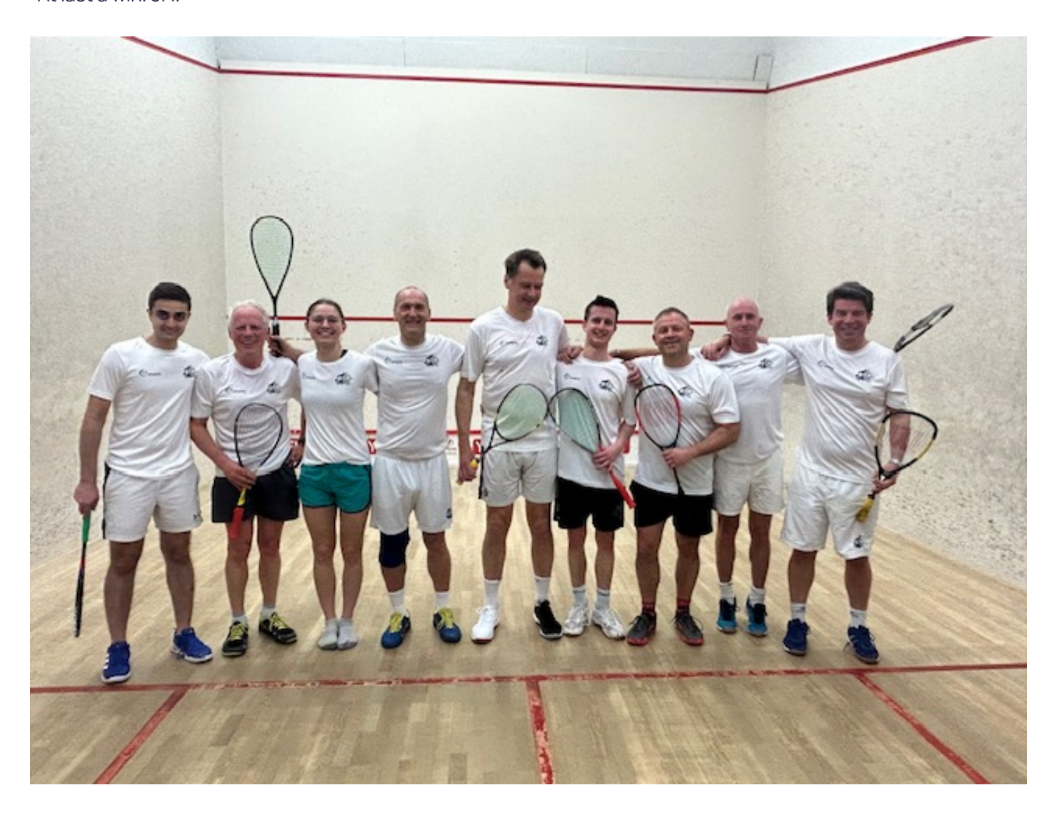
Made the match result look a lot better! But still not great...1/11!